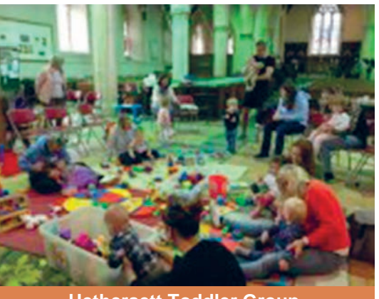
Hethersett Toddler Group

Hethersett and District Churches Together arranges joint acts of worship including Remembrance Sunday, the Week of Prayer for Christian Unity, the Good Friday Easter Walk of Witness and service, an open air service in the centre of the village, carol singing outside Tesco's and the Shrove Tuesday pancake evening which is an