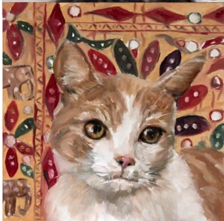
Window Man and Gin Gin Cat by Sharon Fielding - just two of the new images painted by a prolific art- ist with a Heth- ersett connec- tion.